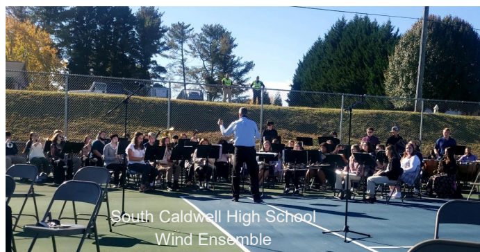
South Caldwell High School Wind Ensemble