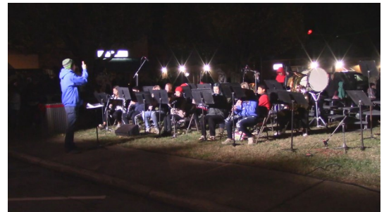
Right: Granite Falls Middle School Band