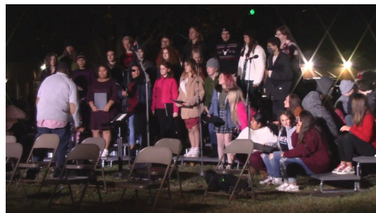
Left: South Caldwell High School Chorus