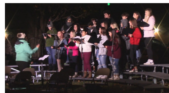
Right: Granite Falls Middle School Chorus

Make some "Christmas Memories" in Granite Falls on Saturday, December 4, 2021 when the Rotary Club sponsors the 2021 Christmas Parade beginning at noon.