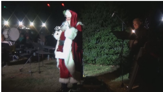
Left: Santa Claus