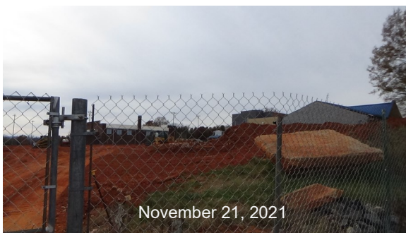
November 21, 2021

During November 2021, workers began turning Mount Granite into a multi-purpose athletic field.