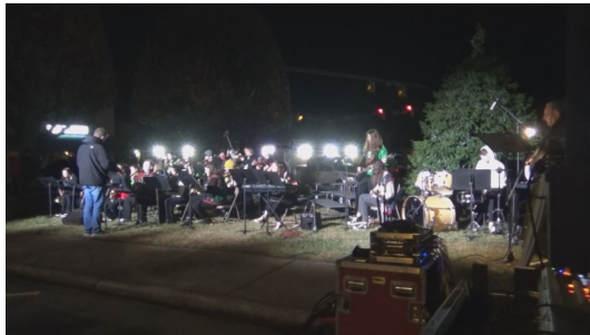
Left: South Caldwell High School Jazz Band