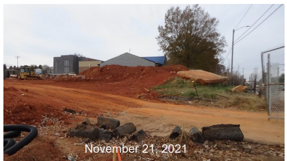
November 21, 2021

During November 2021, workers began turning Mount Granite into a multi-purpose athletic field.