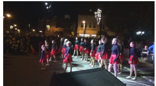
Right: Sims Country Cloggers